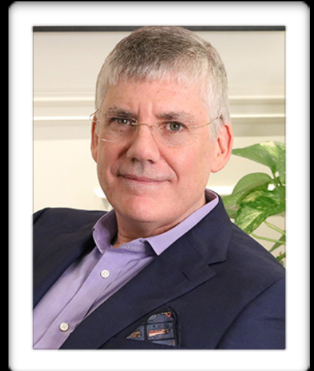
Rick Riordan, Author

Rick Riordan is the #1 New York Times bestselling author of over twenty novels for young readers, including the Percy Jackson book series. For fifteen years, Rick taught English and history at public and private middle schools in the San Francisco Bay Area and in Texas. While teaching in San Antonio, Saint Mary's Hall honored him with the school's first Master Teacher Award. Riordan turned to children's fiction when he started creating THE LIGHTNING THIEF as a bedtime story for his oldest son!